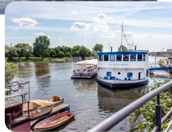
The restaurant ship „Mainod“